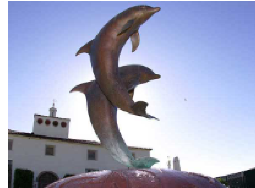
Dean of Students

csuci.edu/studentsupport Report a Concern